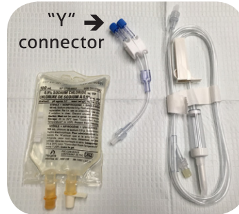
↑ saline bag