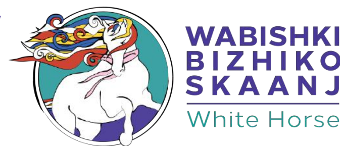
Fig. 2: Wabishki Bizhiko Skaanj Learning Pathway logo