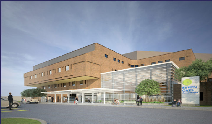
Seven Oaks General Hospital