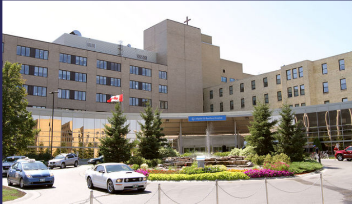
St. Boniface Hospital