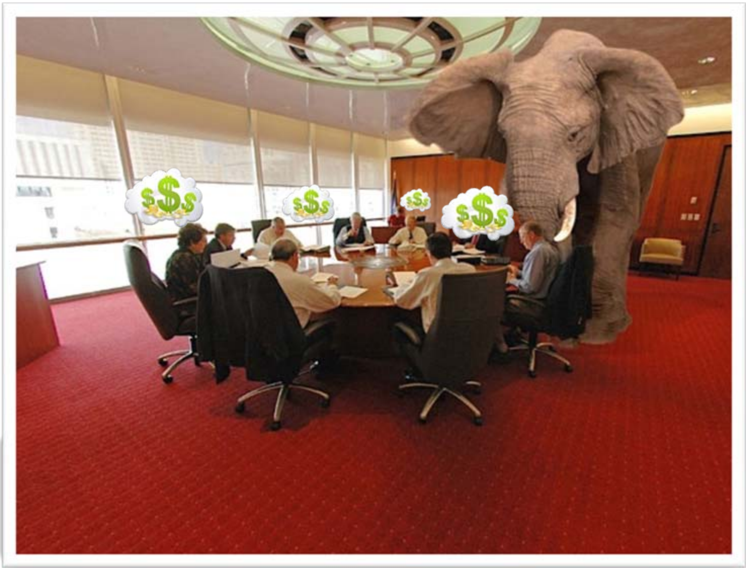
The next BC Provincial Renal Agency Meeting